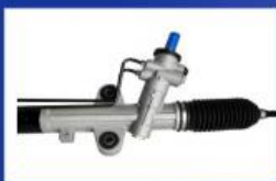
Power Steering Rack