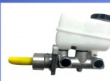
Brake Master Cylinder